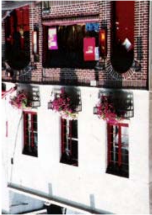
The Stonewall Inn, Greenwich Village

We're on the web! Check us out at: WiltonManorsBusinessAssociation.com